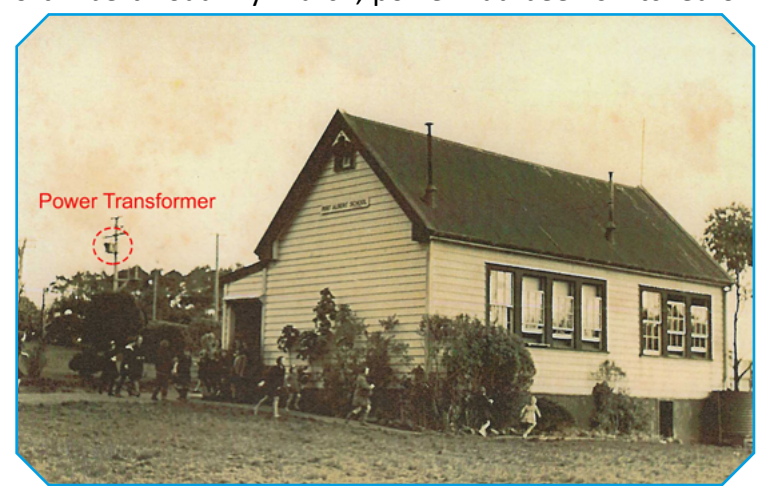
PA School Photo, showing Power Transformer: c 1939

However, a temporary power outage on Sunday, July 31, 1938, brought back the use of candles and milking the cows by hand, albeit briefly.