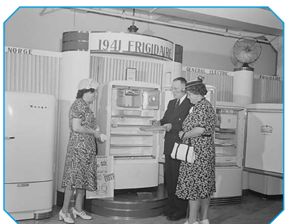
1941: Buying a fridge

Completion of the reticulation work at Te Hana would prompt the work gangs in the district to transfer to Port Albert to install additional branch lines. Numerous houses were wired in anticipation of receiving power. As of April 1938, more consumers were steadily connecting to the Waitemata Electric Power Board's system. The increasing number of farms awaiting connection signalled the need for an additional power line.