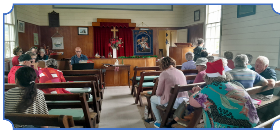
Congregation gathering before Service

As the year comes to a close, the final service was held at the 'Little Church on the Hill' in Port Albert. Welcoming both familiar faces and new attendees, the congregation settled into their seats. The diligent committee, though small in number, ensured the church was adorned for this special occasion. A beautifully decorated Christmas tree stood